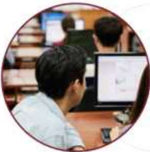
Chosen as SW-oriented University