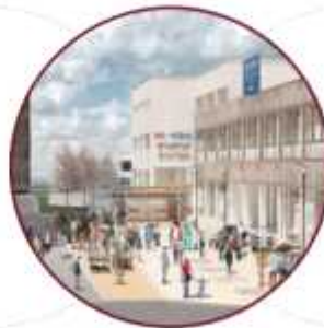
Chosen as Seoul Campus Town Construction Project