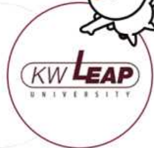
Chosen as Autonomous Contract University for the University Innovation Support Project