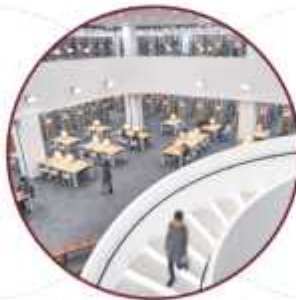
Central Library with advanced ICT technology